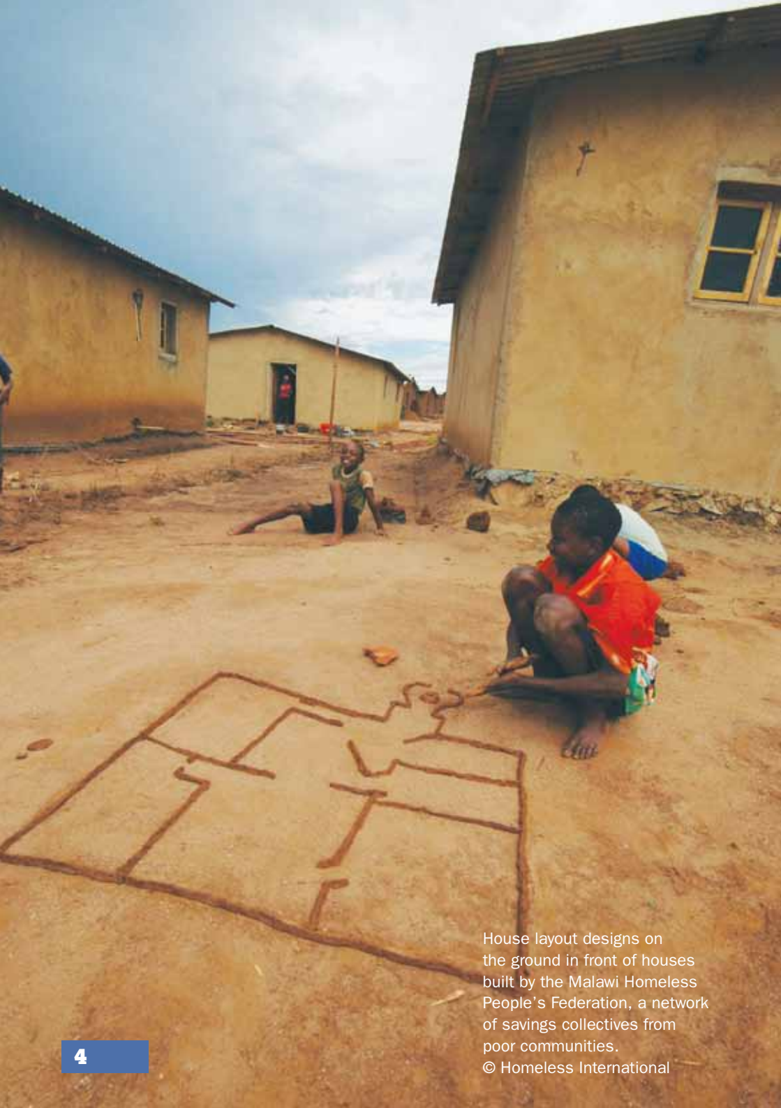
House layout designs on the ground in front of houses built by the Malawi Homeless People's Federation, a network of savings collectives from poor communities.