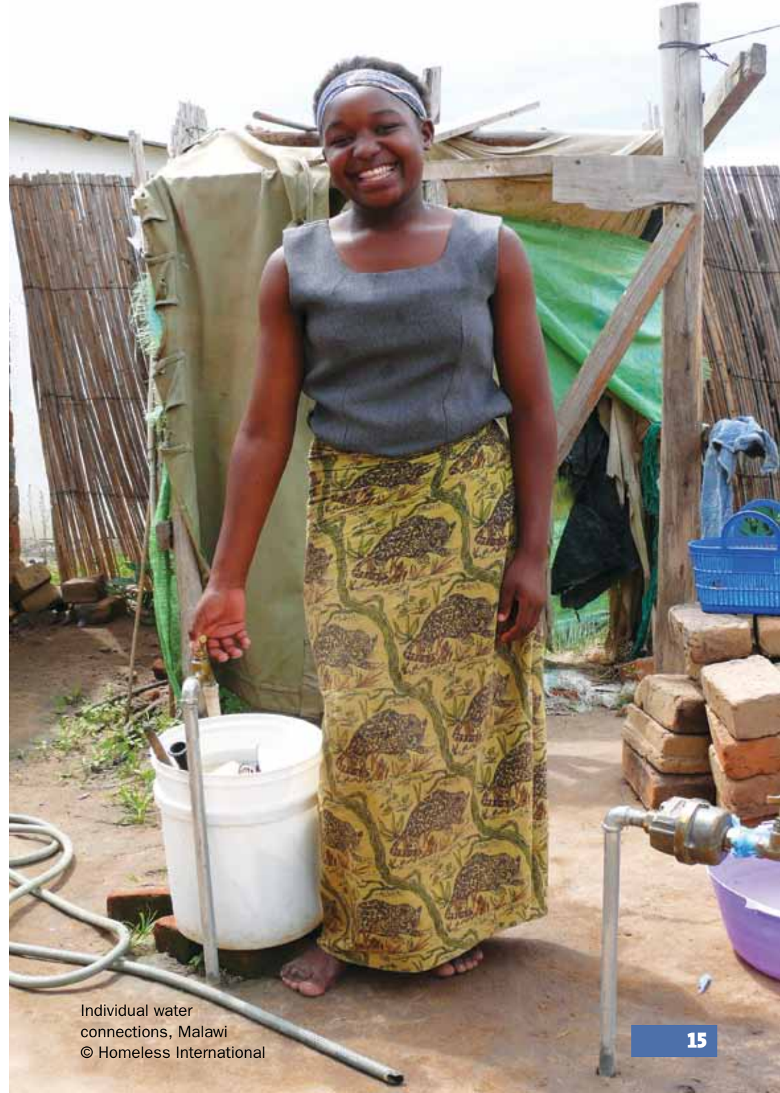
Individual water connections, Malawi

“The responsibility for building institutions that will be the bedrock for urbanisation in all parts of the country lies mainly with the central government. Chief among them are those governing the management of land.” (World Bank, 2009)